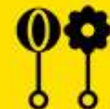
Early Childhood Education Equipment