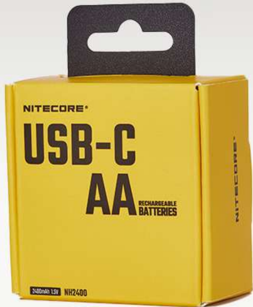
NH2400 x 4