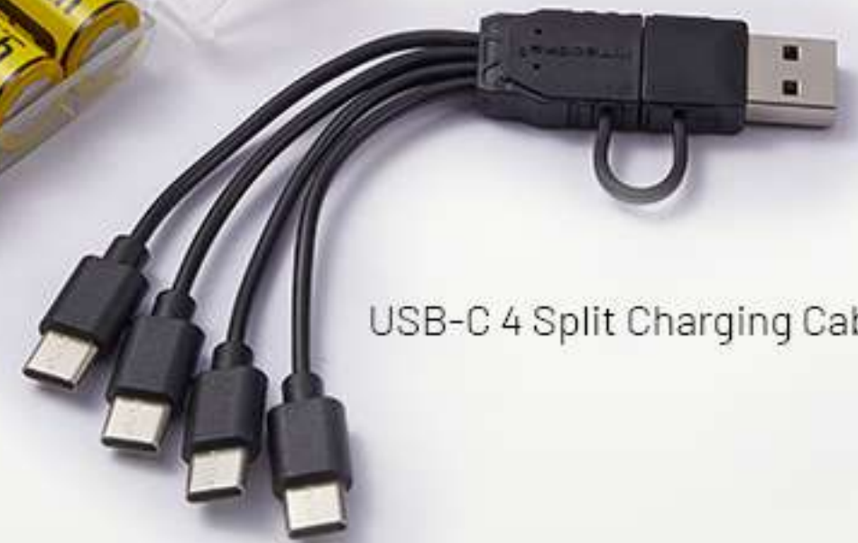
USB-C 4 Split Charging Cable